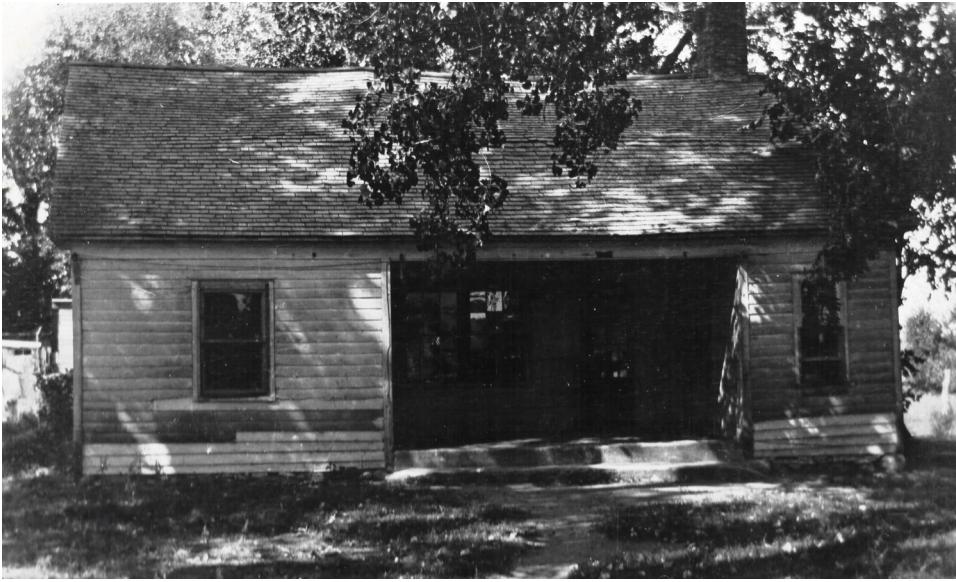
The Rowen House located in Horse Grove south and west of Rowan. The house was located across the road from the log house that Joe & Lainie Haugen live in now on Uptagraph. Built approximately 1855/56.